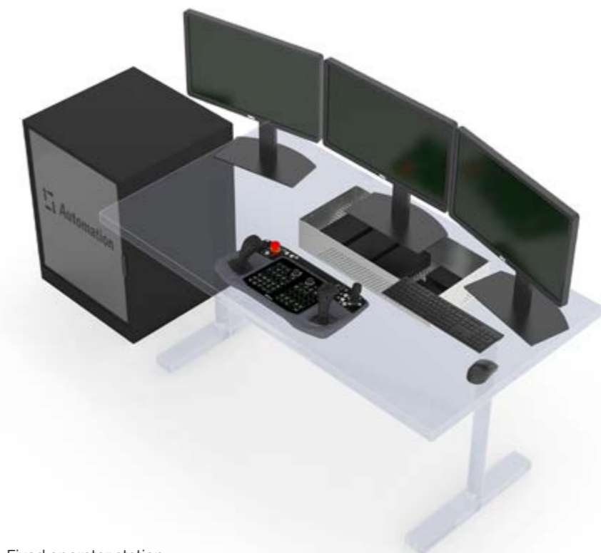
Fixed operator station.